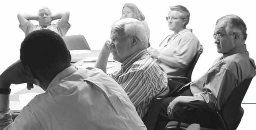
Advisory Committee, July, 2006